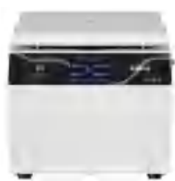
Cell Smear centrifuge