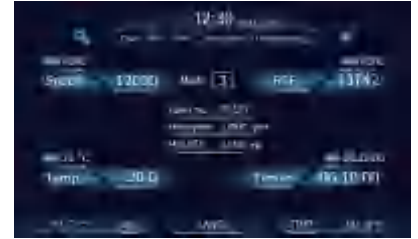
Highly sensitive touch screen (Low Temp.)