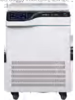
DL-1050 (On Floor)