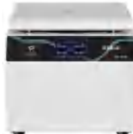
Lab PRP Centrifuge