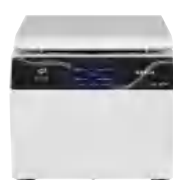
Cell washing centrifuge