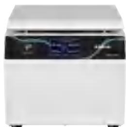
Milk Fat Centrifuge