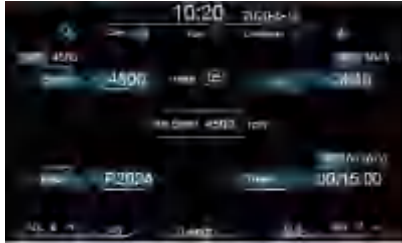
Highly sensitive touch screen (Ambient Temp.)

METHER's self-developed UI interface system offers excellent human-machine interaction. The 3D interface is simple and clear, displaying all parameters at a glance. The overall appearance of the machine is aesthetically pleasing and visually appealing.